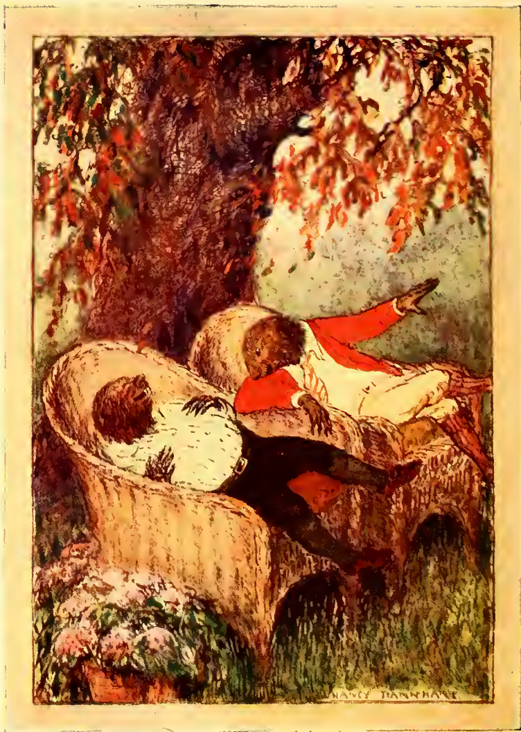
OUT ON THE LAWN, ROARING WITH LAUGHTER